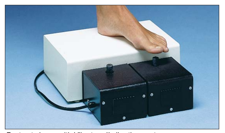
Footrest shown with Vibratron-II vibrating posts