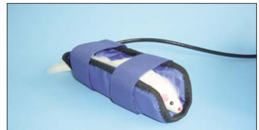
WB-1 Animal Warming Blanket