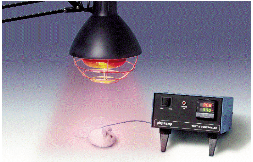
TCAT-2 Temperature Controller with RET-3 temperature probe and HL-1, Heat Lamp

Our new TCAT-2 family of general purpose PID Autotuning Controllers provides accurate temperature control in a variety of laboratory applications. Combined with a heat lamp or heating pad, the TCAT-2 may be used to maintain the body temperature of anesthetized animals during surgery or stereotaxic procedures. Small animal cages are easily warmed with a heat lamp. The TCAT-2 may also be used in cooling applications, such as to control independent perfusate cooling systems. Realizing that laboratory applications are diverse, Physitemp can provide several versions of the TCAT Controller. The model specified depends on whether a laboratory has a general or specific need for the controller: