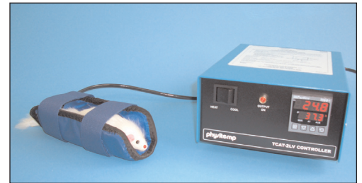
TCAT-2LV with WB-1 animal warming blanket

Both blankets feature overtemperature protection which prevents the blanket temperature from exceeding 42°C in the event that the primary feedback sensor becomes disconnected. Please note that the blanket must be supplied with the controller to match the overtemperature unit setting.